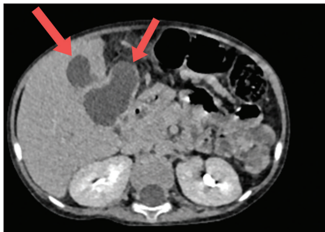
Figure 1: Contrast enhanced computed tomography image of abdomen showing multiple hypodense lesions in the liver (red arrows).