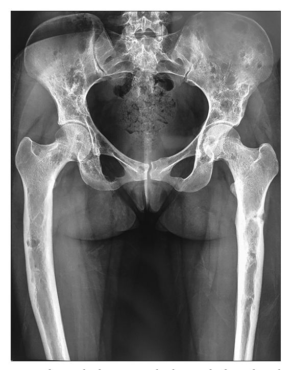
Figure 1: Radiograph showing multiple punched-out lytic lesions with sclerosed margins.

A 23-year-old girl presented with complaints of bone pains, recurrent fractures for 3 years of age, bilateral neck swelling for 8 years, and abdominal pain for 1 year. She denies any constitutional symptoms. On examination, there were no organomegaly and bleeding stigmata. Her CBC profile was absolutely normal. Her radiograph of B/L hip joint [Figure 1] revealed multiple punched-out lytic lesions with sclerosed margins and fracture left shaft femur. CECT of the abdomen [Figure 2] revealed a spleen of normal size with multiple hypodense lesions ranging from 1 to 10 mm in size. The visible axial skeleton including spine, ribs, hip bones, and B/l proximal femur showed multiple punched-out lytic lesions with sclerosed margins. The CT-guided biopsy of the osteolytic lesion was consistent with